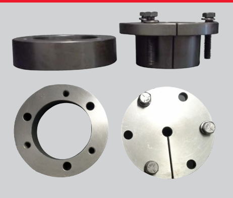
All our QD bushes are available in pilot bore, and can be re-bored to suit the shaft requirements. Currently stocking E, SD and SF