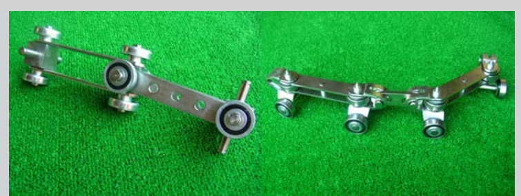
LAMB/MUTTON SLAUGHTER CHAIN